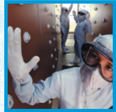
Ideal for extremely low pressure, regardless of adverse environments.

The Altek Automated QuikCal 891P Pressure Calibrator, for critical low pressure applications, features an automatic, built-in pump to generate and control pressure automatically from 0.002 "H 2 O to ±200.000 "H 2 O and slash your pressure testing time, while boosting productivity and critical accuracy. Now you can calibrate a draft range transmitter in less than five minutes! The results: substantial time and dollar savings, and continuous productivity.